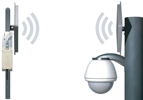
Shown with optional AW23-5800 antennae purchased separately

The AW-D5800 and AW-H5800 replace costly cables and trenching with a line-of-sight, wireless network camera housing that enables remote network cameras. AvaLAN's products offer the ideal combination of price, penetrating range, data rate, security, interference avoidance, Quality of Service, and ease-of-use.