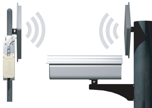
Shown with optional AW23-5800 antennae purchased separately

Or upgrade to optional AW23-5800 antennae