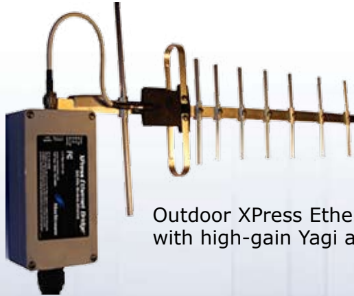
Outdoor XPress Ethernet Bridge with high-gain Yagi antenna